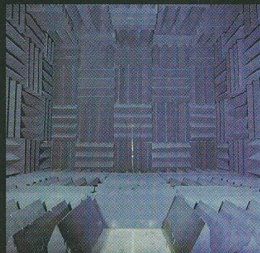
"reflection-free (anechoic) measurement chamber"

models have become industry benchmarks, as evidenced by the many rave magazine reviews they have received within the world's most respected and best read trade journals, etc.