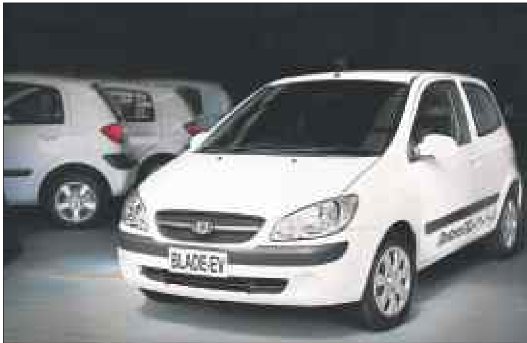
CUTTING EDGE: The Blade Electron DGL is a remanufactured Hyundai Getz.

According to the company's website, other executives have worked at GM Holden, ExxonMobil, Goldman Sachs and Morgan Stanley.